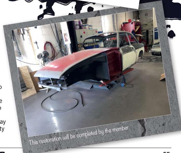
This restoration will be completed by the member

This MGB GT is another restoration although it has been started by the customer. They stripped the car and carried out some of the welding work and then handed it over to us to align the panels and paint it all up. Once we are finished, it will be ready to be handed back to the customer. It's got a long way to go but it will be a beauty once it's done.