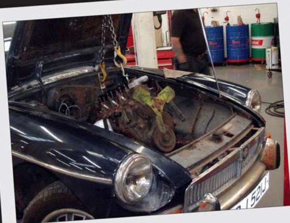
Out with the old...

This early MGB roadster used to be Iris Blue. Now it's with us for major body restoration using old stock original MG panels stored by the customer. The most exciting part? It will be returned to the original colour when the rest of the work is complete. Have you dramatically changed the colour of your car like this MGB? Email enjoyingmg@mgownersclub.co.uk with your before and after photos for a chance to be featured.