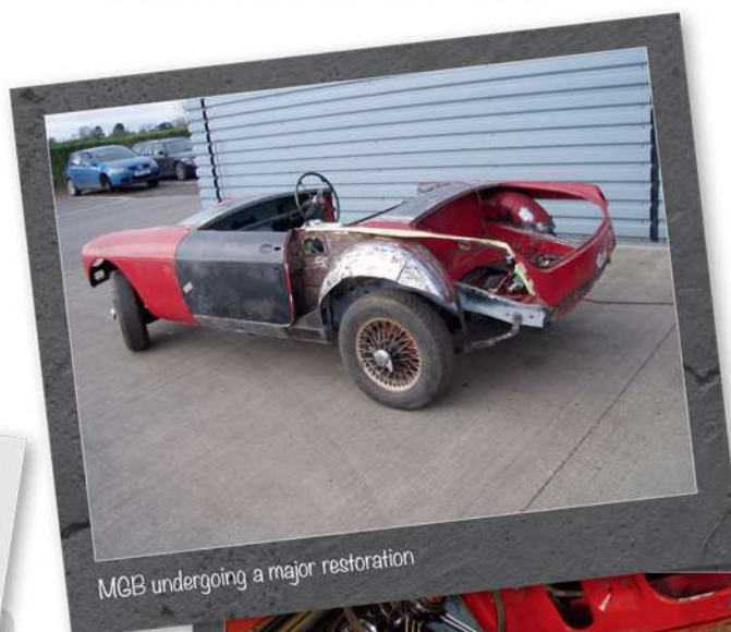
MGB undergoing a major restoration