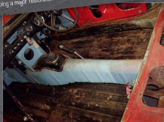
You can see the original colour here

Out with the old, and in with the new. This MGB 1800 is being converted to a 4.0 litre V8. Once the many modifications are complete and it will all be removed again ready for bodywork restoration and paintwork to be completed.