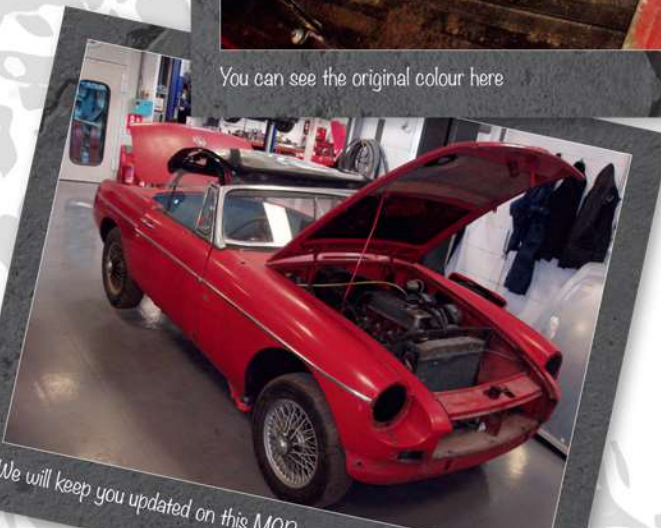
We will keep you updated on this MGB