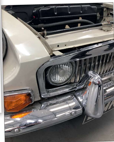
Auxiliary lights are set into grille