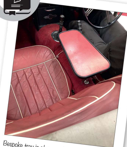
Bespoke tray in place ready for a picnic