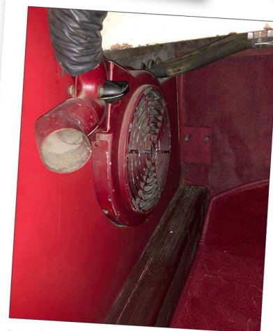
Individual heater in one of the footwells