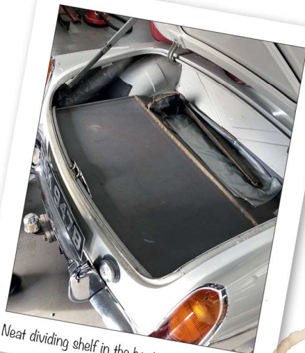
Neat dividing shelf in the boot