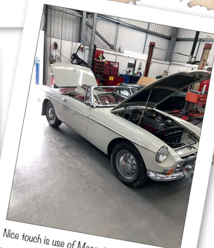
Nice touch is use of Magnette hubcaps