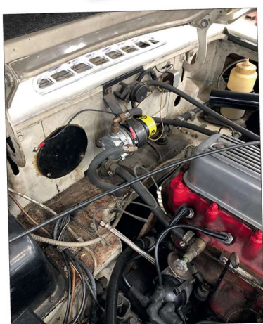
Easy-access fuel pump under bonnet